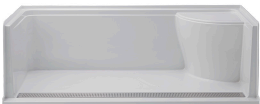
TZ3260 Seat Right 60x32x21"