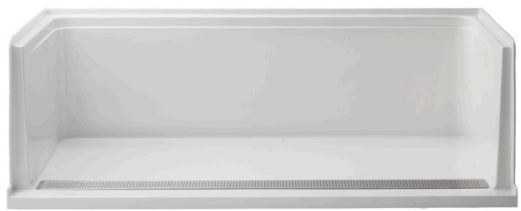
TZ3260 No Seat 60x32x21"