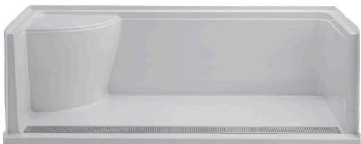
TZ3260 Seat Left 60x32x21"

Available in three styles. Choose the one that best fits your needs.